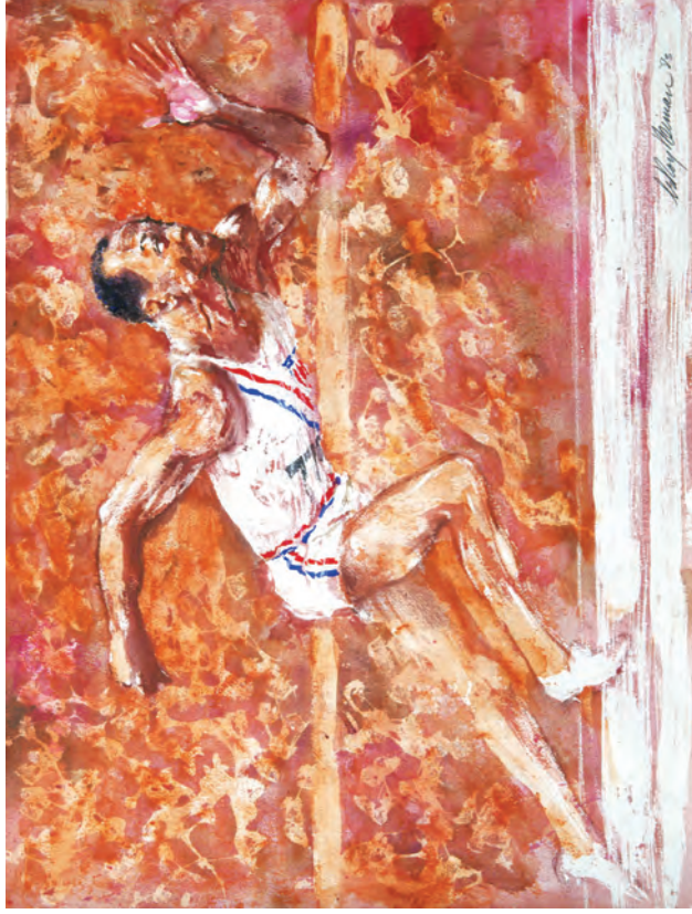
LeRoy Neiman (American, 1921-2012) Jesse Owens , c. 1980. Watercolor on paper. 18 x 23 3 / 4 inches. Courtesy of the LeRoy Neiman Foundation.