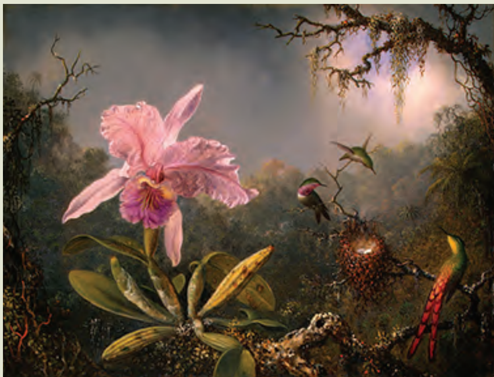
Martin Johnson Heade, Cattleya Orchid and Three Brazilian Hummingbirds , 1871. National Gallery of Art.