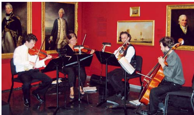
Baton Rouge Symphony musicians entertain in the LSU MOA Hibernia Gallery with paintings as a backdrop at River Views & Vibes.