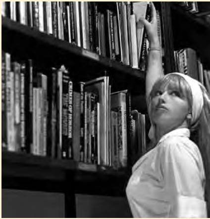
CINDY SHERMAN (American, b. 1954) Untitled Film Still (Librarian #13) , (detail) 1978, gelatin silver print. From the collection of JPMorgan Chase. Image courtesy of the Artist and Metro Pictures.

People and places are major themes in the JPMorgan Chase art collection. Contemporary artists engage with these basic topics across a diverse range of styles and techniques. Questions and dialogues about who we are as individuals and as communities, and what our relationship is with our changing environment – both natural and fabricated – are critical issues in the world today, regardless of culture or geography. Of People and Places is an exhibition of over forty works from a global collection that has great breadth and depth. This exhibit celebrates the JPMorgan Chase Art Collection's 50th Anniversary in 2009.