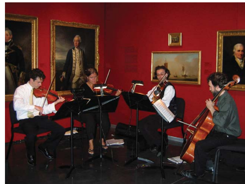
Baton Rouge Symphony musicians entertain in the LSU MOA Hibernia Gallery with paintings as a backdrop at River Views and Vibes.