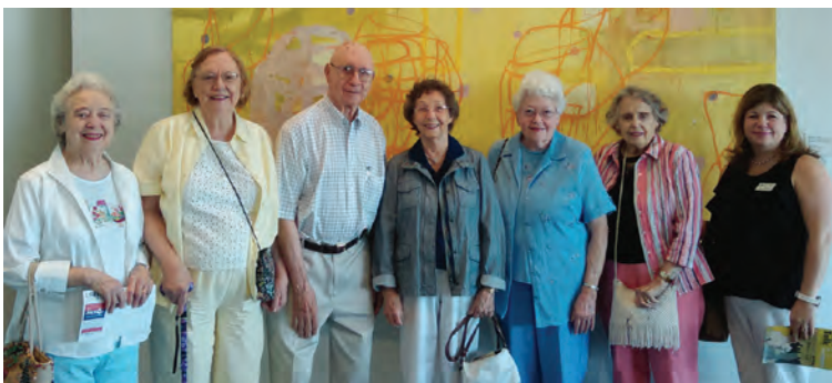
St. James Place residents visit the Museum on August 6.

This fall ushers in the third year of ArtWorks, the Museum/school multi-visit program. We will be adding White Hills Elementary’s third grade, Bernard Terrace’s kindergarten, and a new partner school – Park Elementary.